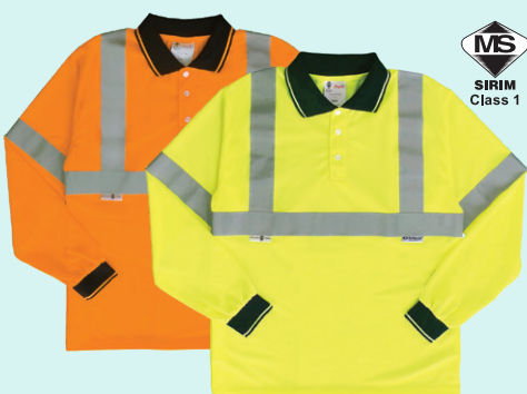
TS1BS - L

Fluorescent colour polyester fabric, long sleeves, ribbing collar, button down collar, glassbeads reflective tape.