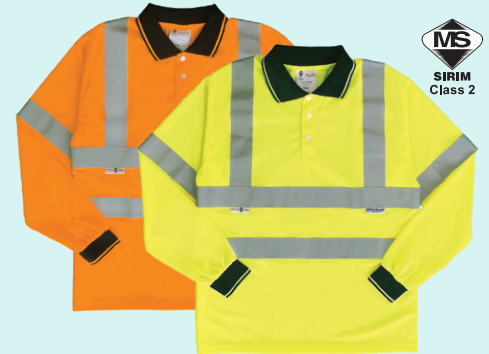
TS2BS - L

Two reflective band around body & one reflective band on sleeves