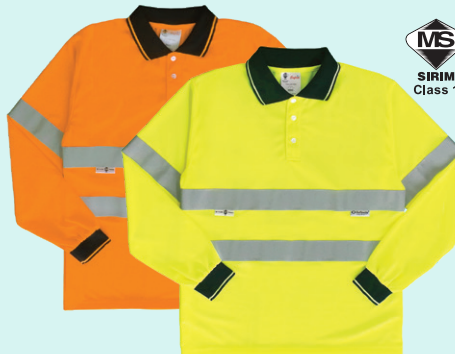
TS2B - L

Two reflective band over shoulders, one reflective band around body & one reflective band on sleeves